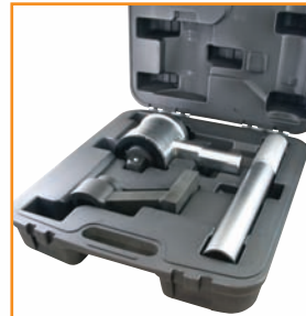
Includes blow mold case.