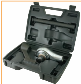
Includes blow mold case.