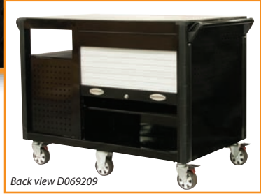
Back view D069209